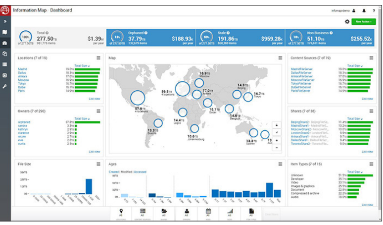
Figure 4. Veritas Information Map renders your information environment in visual context and guides users towards unbiased, information-governance decision making.